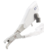
LigaSure™ Exact Dissector