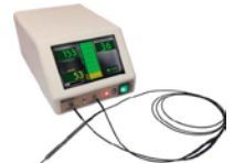
PTeye™ Parathyroid Detection System: Acquired - Pending commercialization in Europe