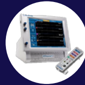
NIM™ 3.0 Pulse, Response, Neuro