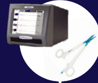
NIM™ 2.0 Pulse, Response, Neuro LigaSure Precise™